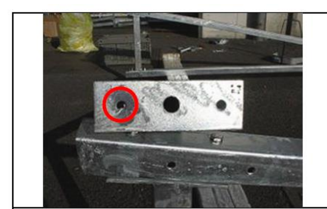
During galvanising, the holes may have become partly blocked